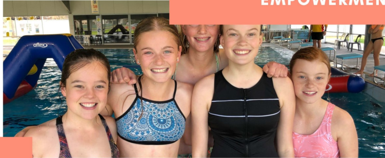
Friday 28th June