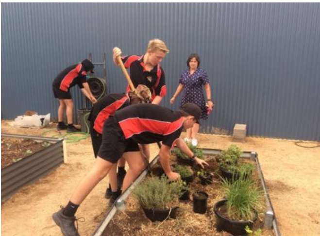
Repositioning the herb pots