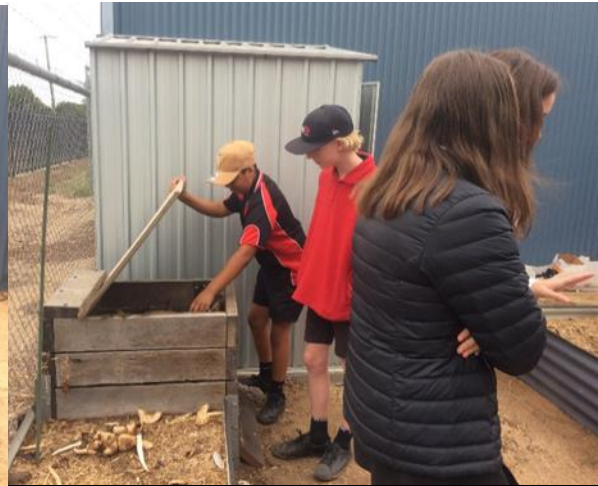
Checking out the worm farm