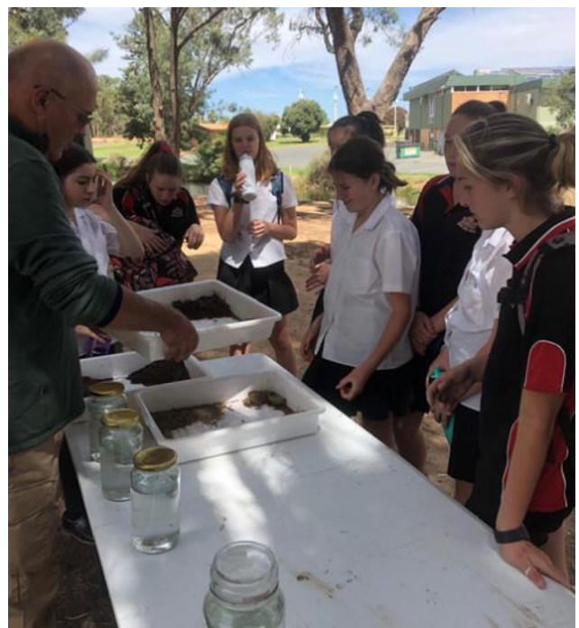
Year 8 Yellow pH testing