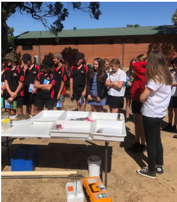
Year 8 orange soil samples

That the lagoon system...has been wrecked over the years and we need to fix it – Marcus (8 Green).