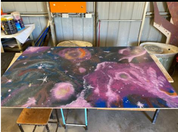
Galaxy painting workshop provides an extraordinary background for Indigenous totems to later be painted.