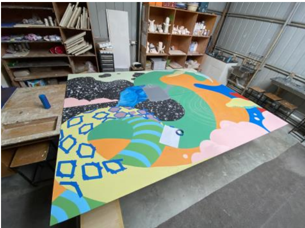
A sneaky peek of the 'Mental Health Awareness' mural currently under construction.