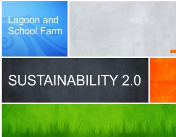
Bede Orr and Luke Todd, 8 Blue

Recently in Sustainability Year 8 has been to the Island Sanctuary. We walked around looking for different weeds and found a lot including Soursob, Spear Thistle, Wall Fumitory, Cape Weed and (everyone's favourite purple flower!) Paterson's Curse. In our digital lessons we have been working on creating our final project, a website and an information board. 8 Blue have been looking at the animals that are part of the lagoon system and those that are at the school farm. We are exploring their habitat, lifecycle, distribution and food web. At the farm last week we got to milk some of the cows by hand and weigh the cows and sheep. We are also mapping the school farm using Esri software.