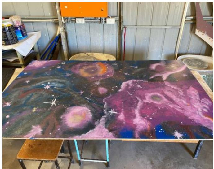
1 or 4 panels. Galaxy background created by the Indigenous Art Group, ready to paint their family totems in coming weeks