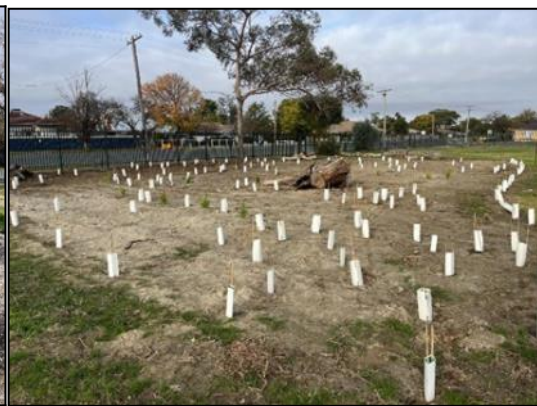
Phase 2 – Planted May 2023