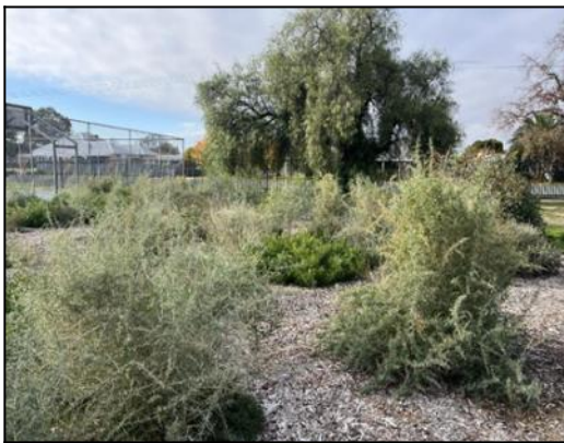
Phase 1 - Planted May 2022